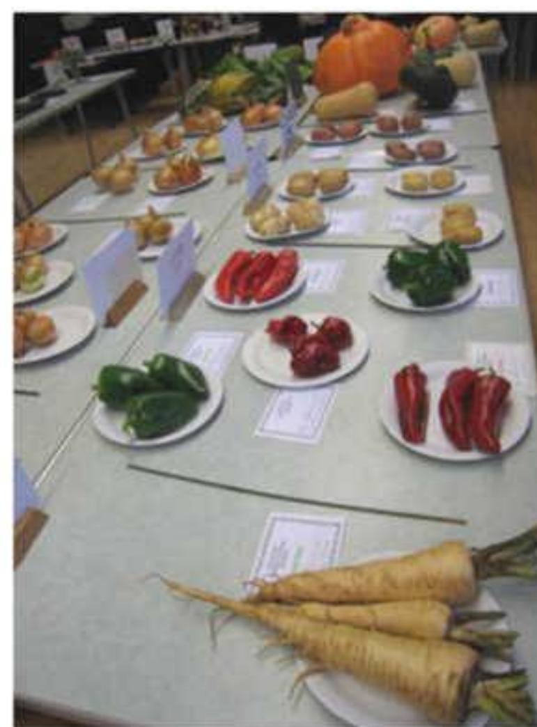
Autumn No. 6