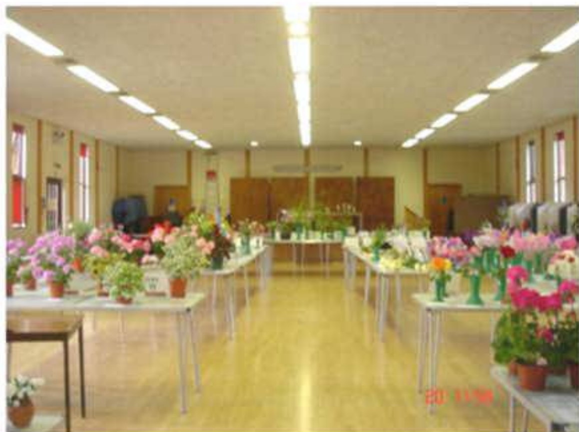
Summer No. 1