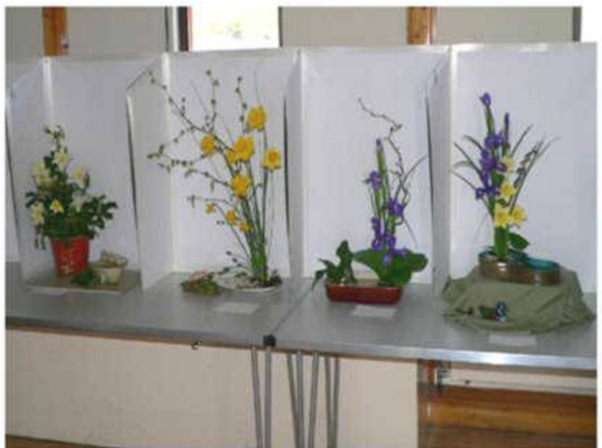
Spring No. 4