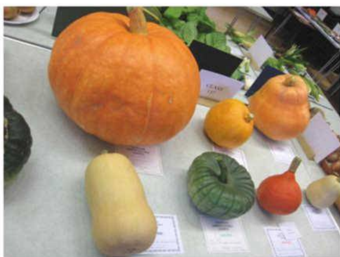
Autumn No. 3