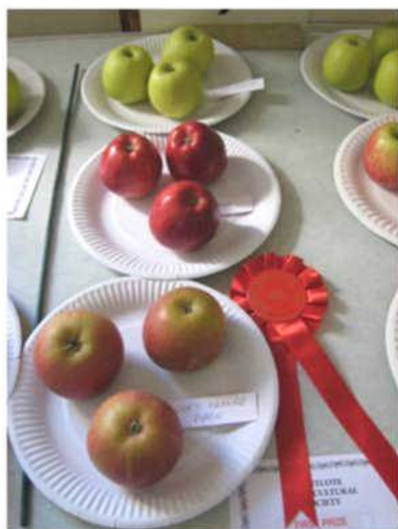
Autumn No. 5