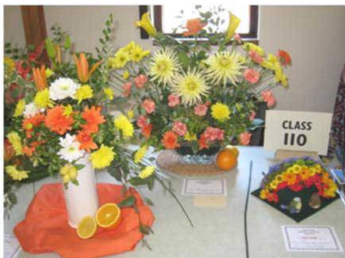
Autumn No. 1