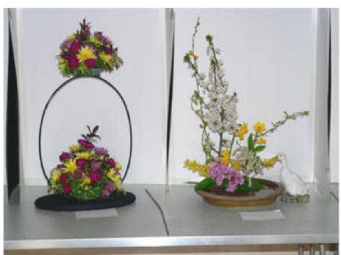
Spring No. 6