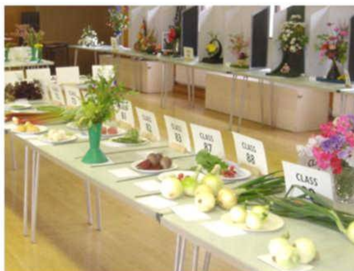
Summer No. 4