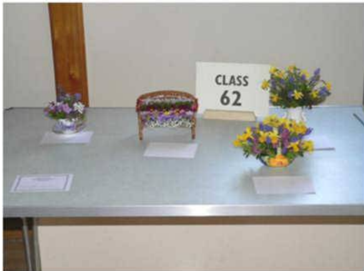
Spring No. 1