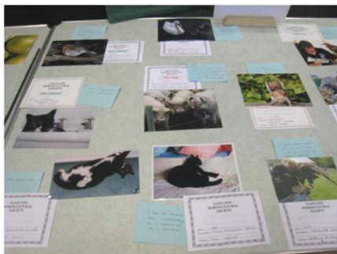
Autumn No. 2