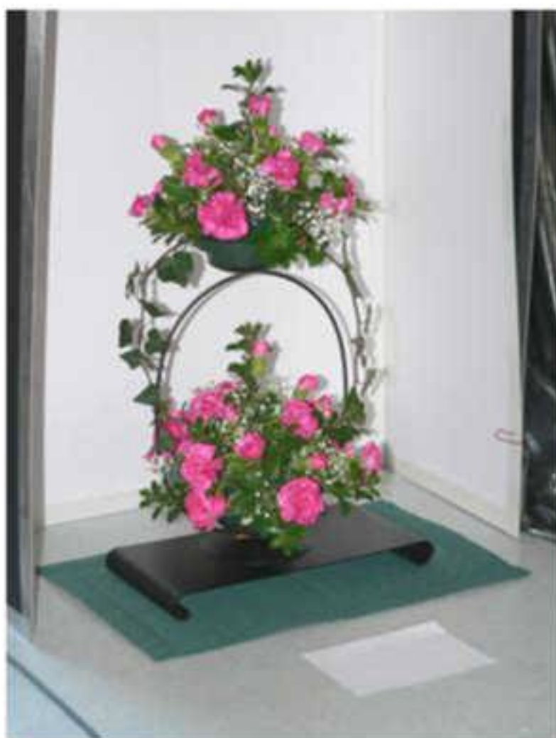
Spring No. 5