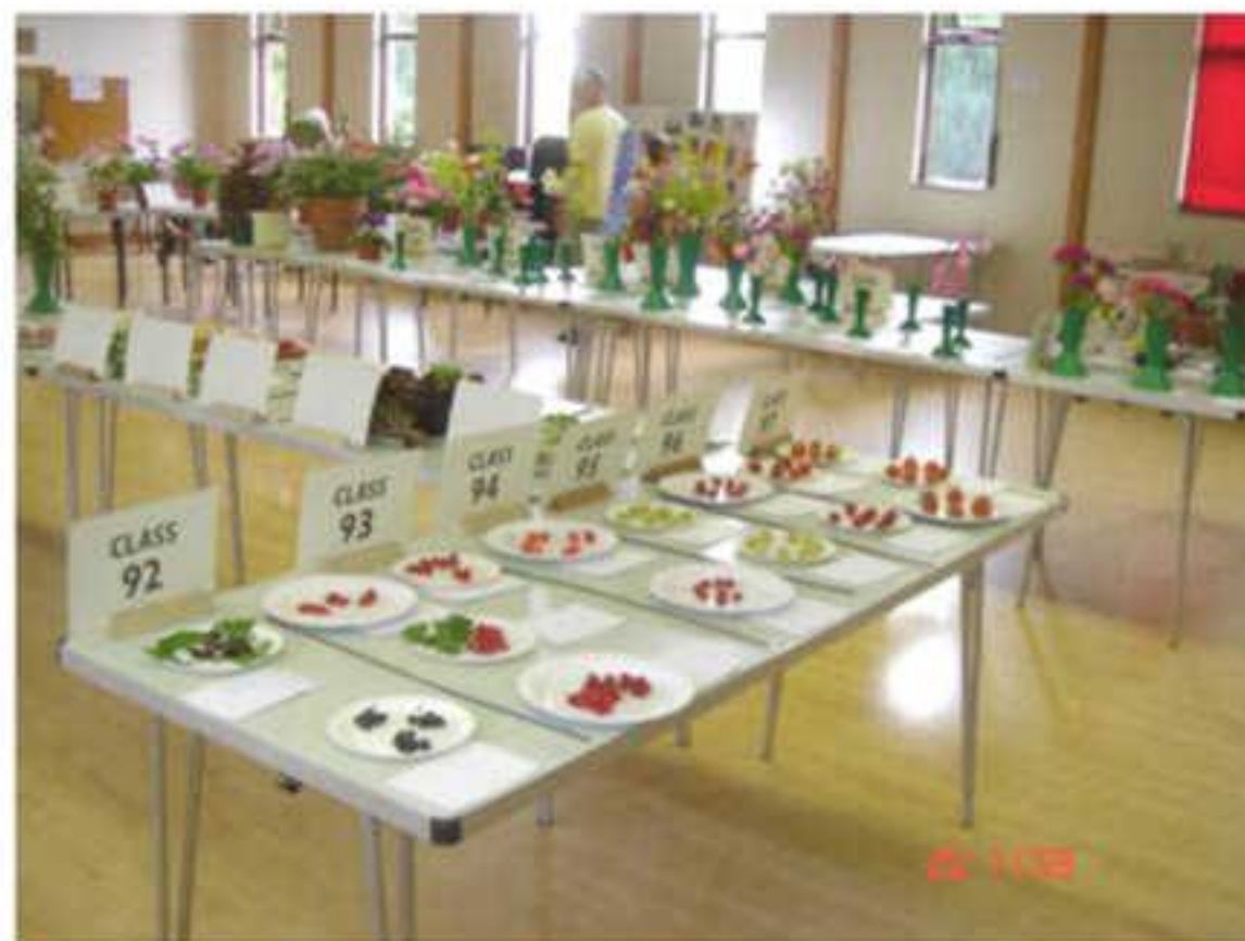
Summer No. 2