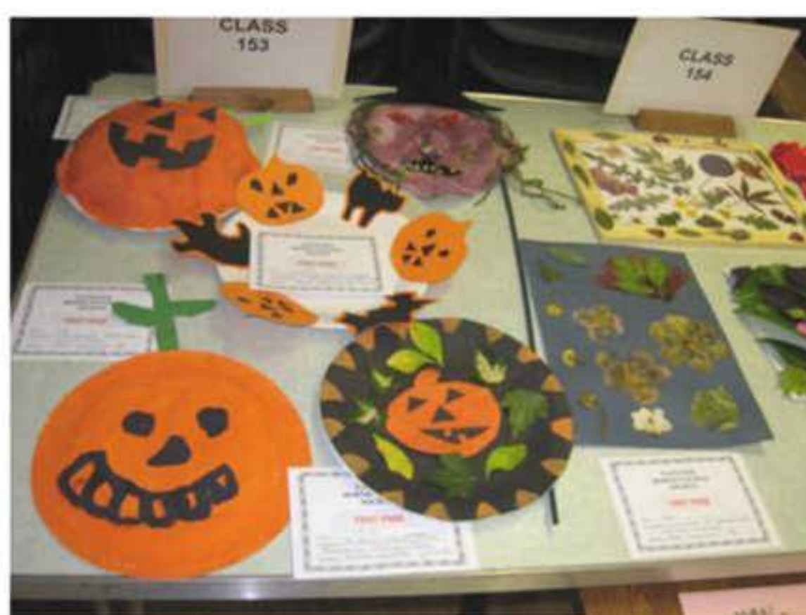
Autumn No. 4