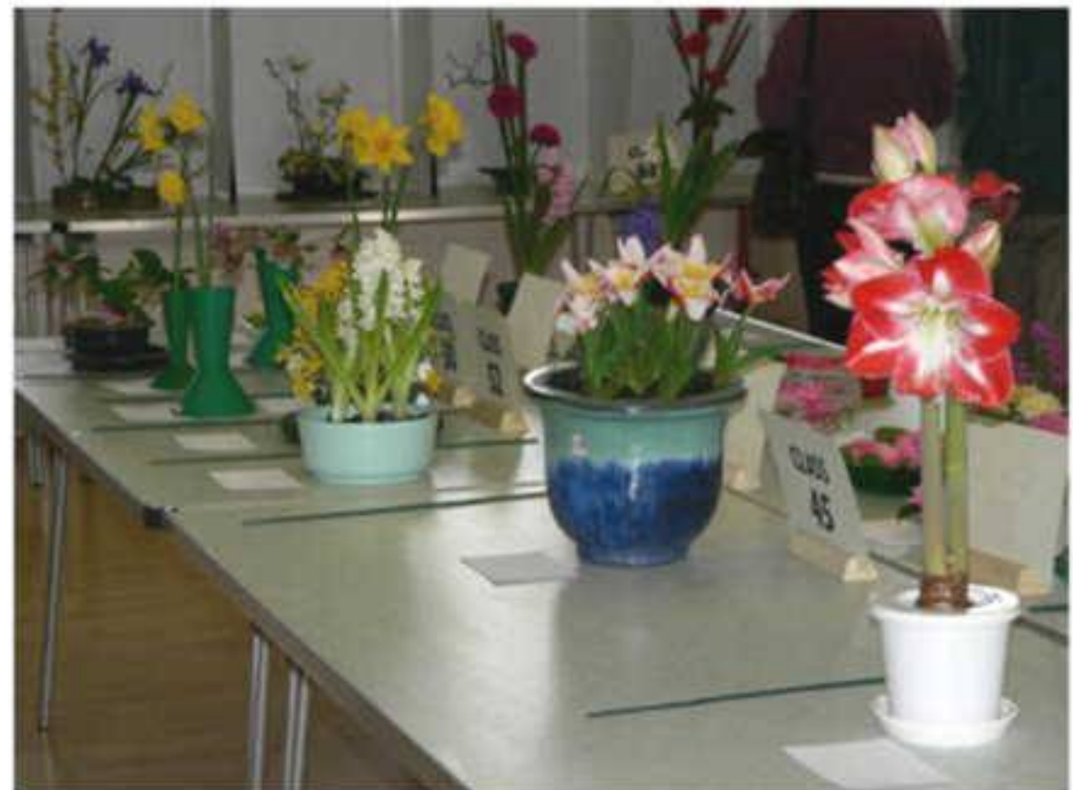
Spring No. 2