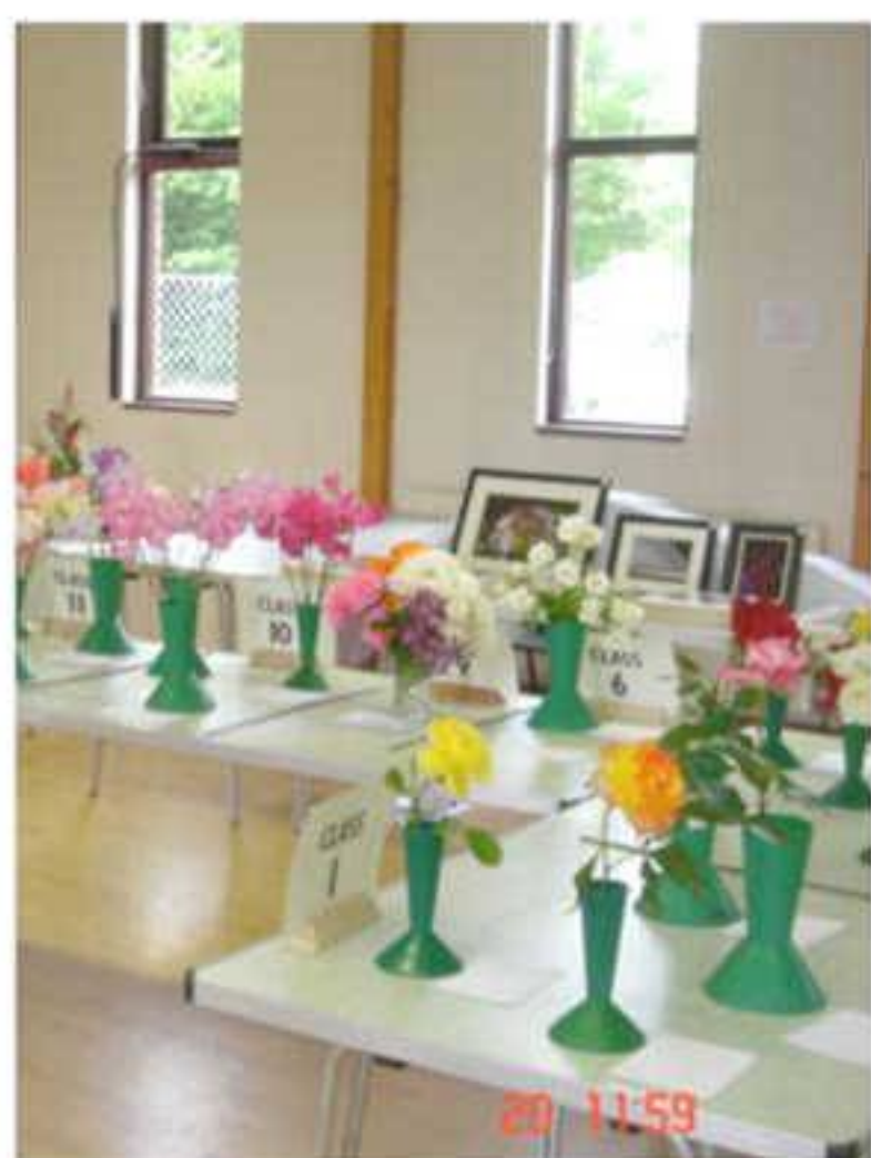
Summer No. 5