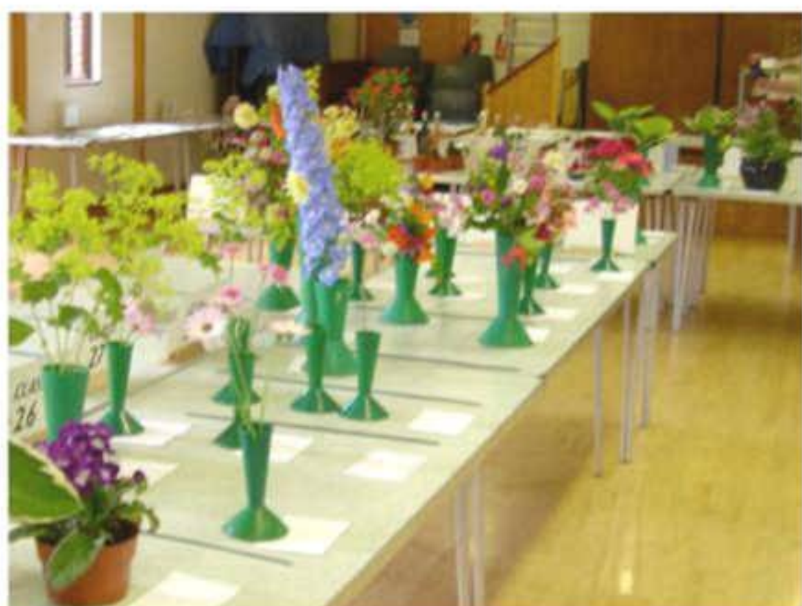
Summer No. 3