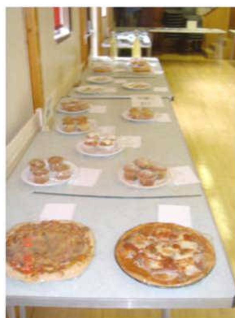
Summer No. 6