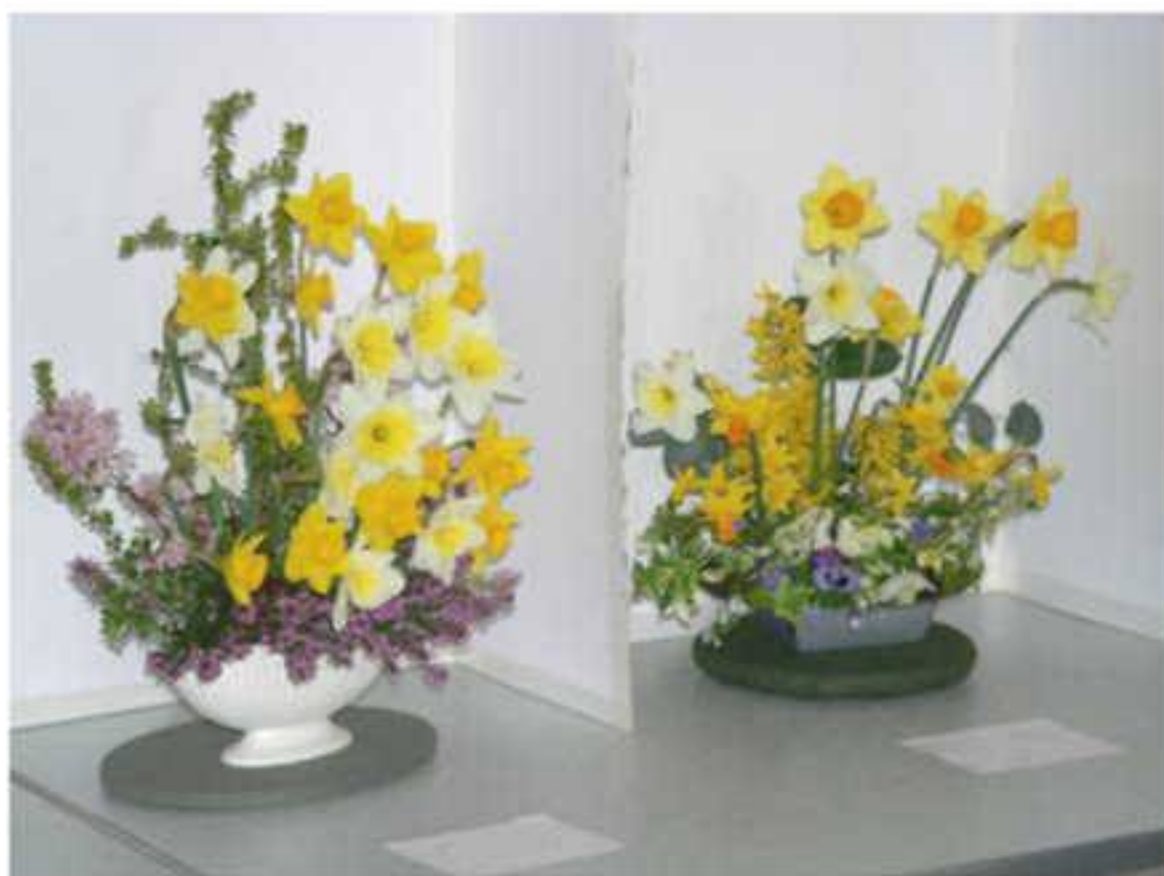
Spring No. 3