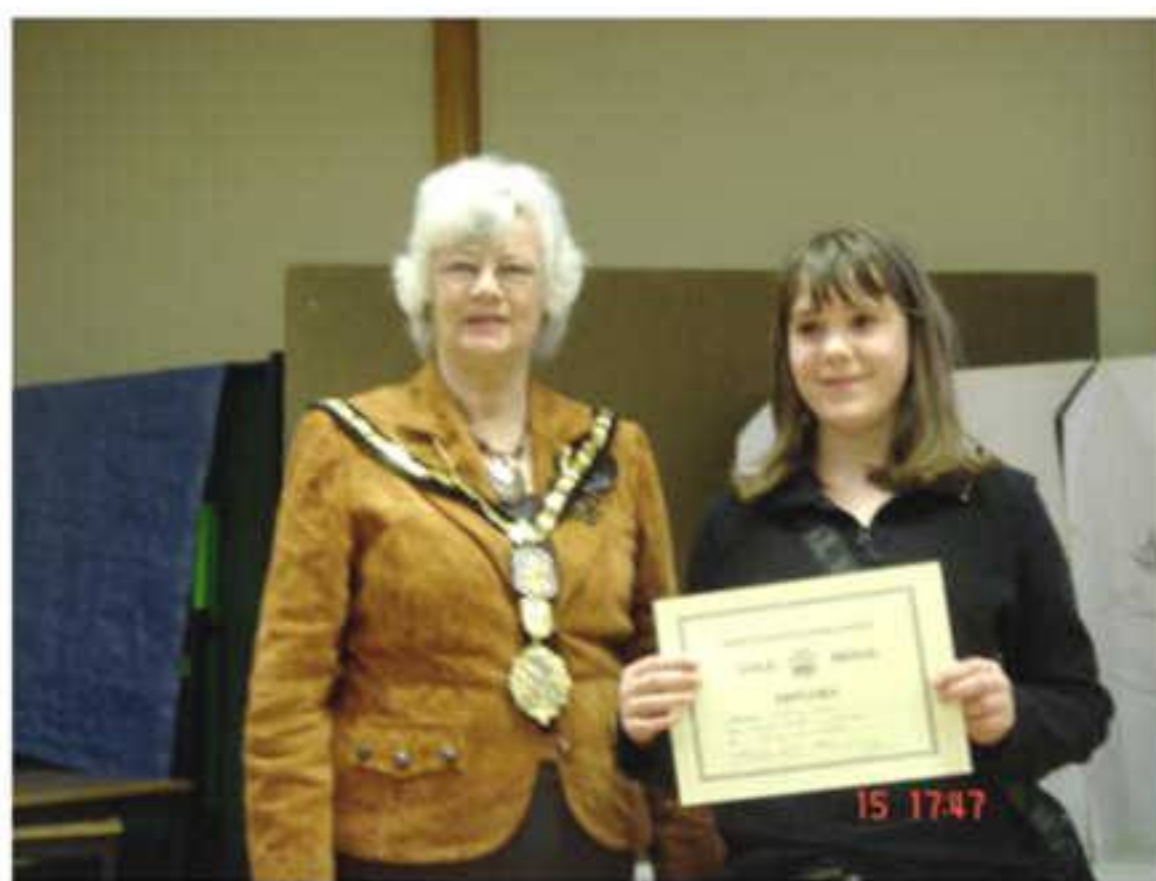
Spring No. 3