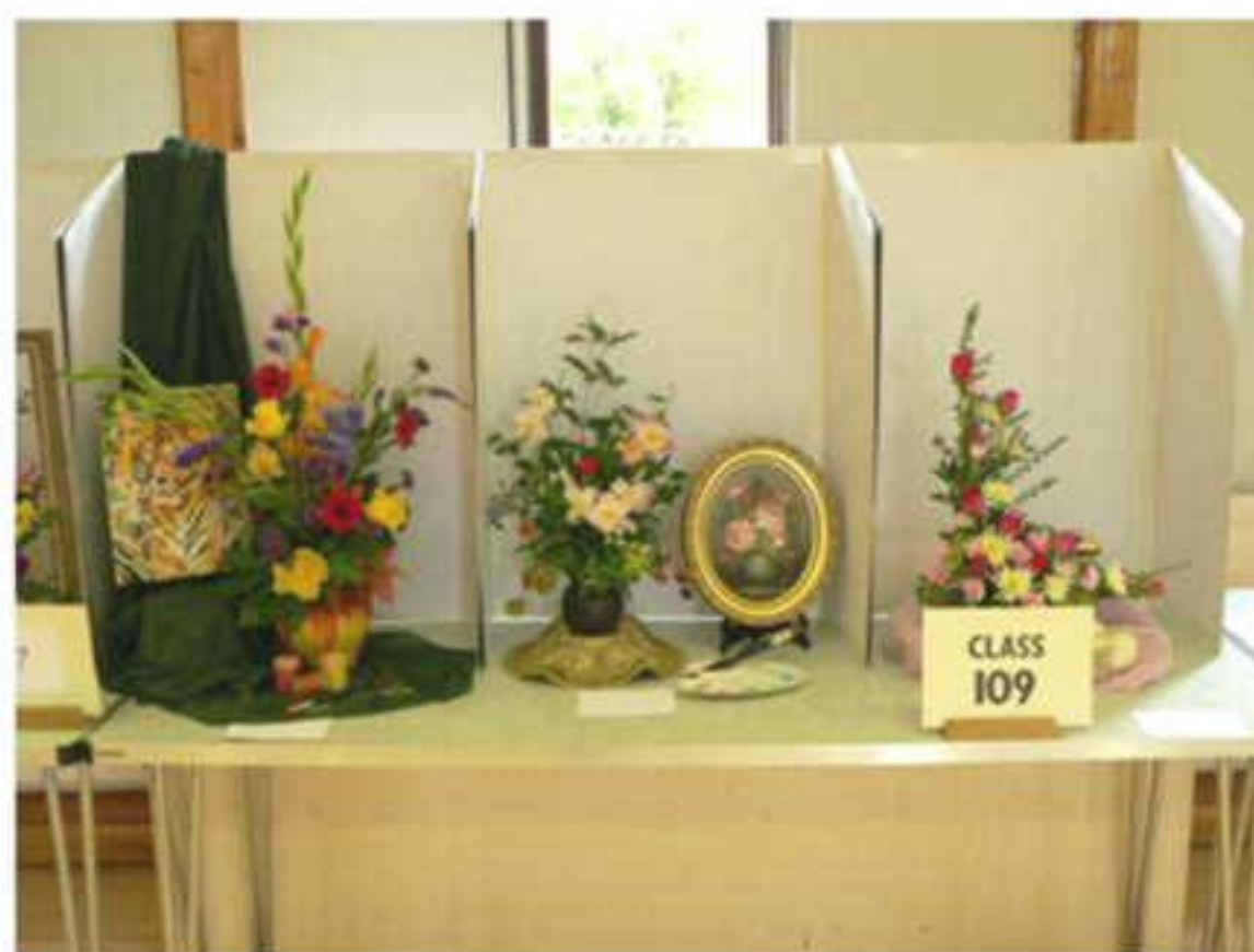
Autumn No. 4