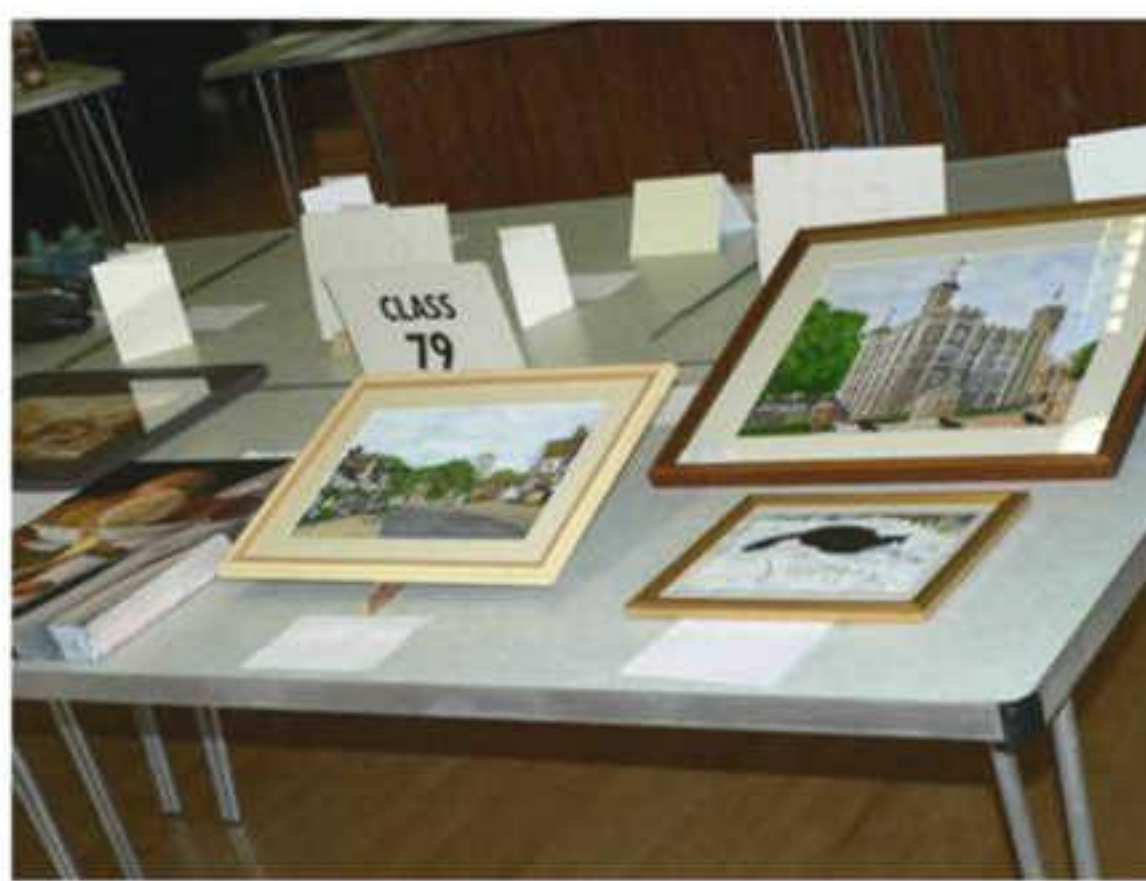
Spring No. 6