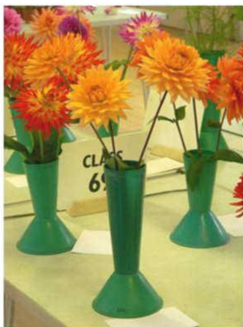
Autumn No. 5