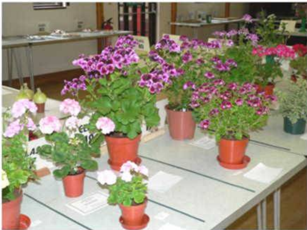
Summer No. 1