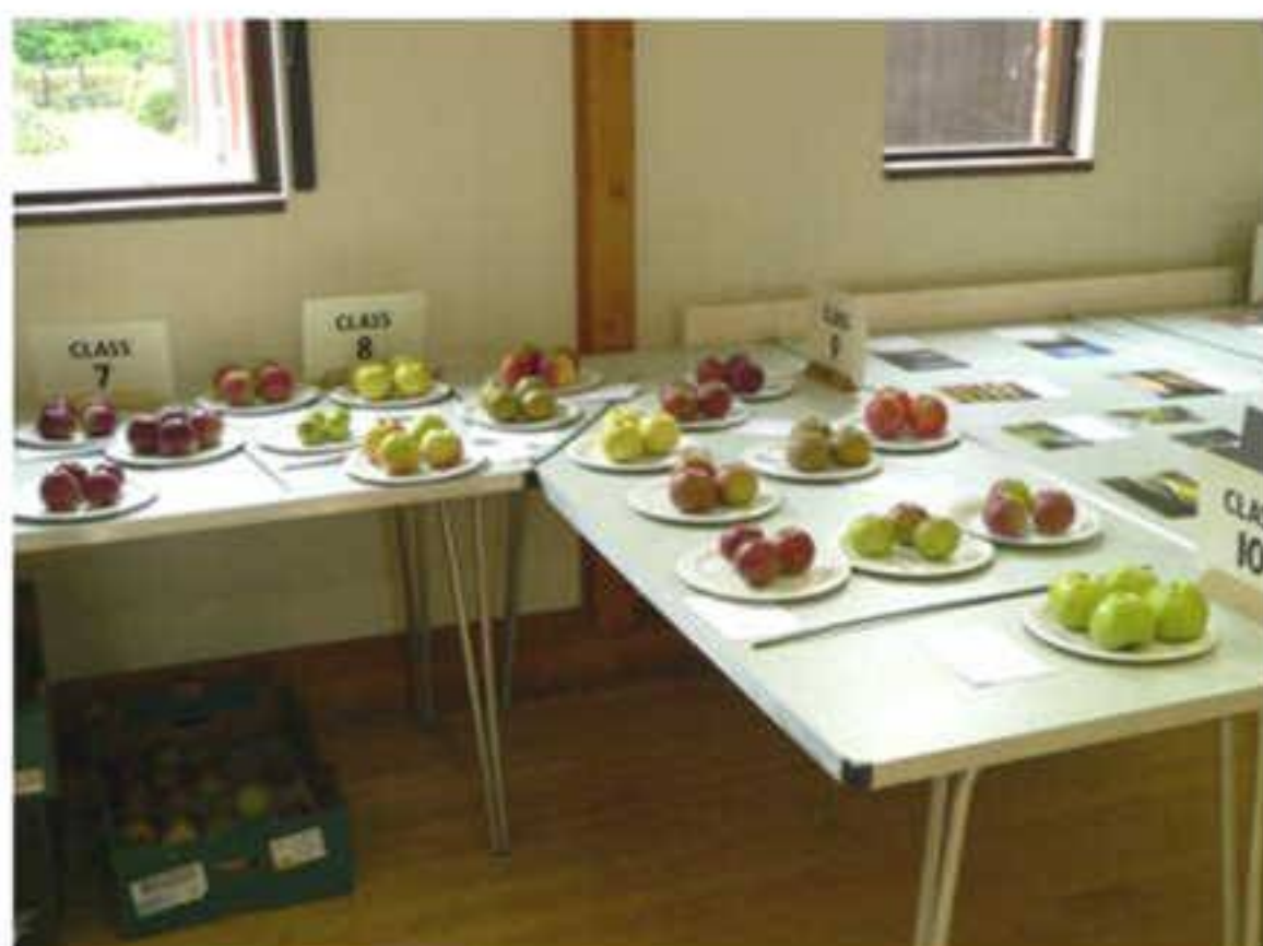
Autumn No. 1