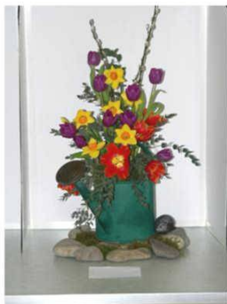
Spring No. 5