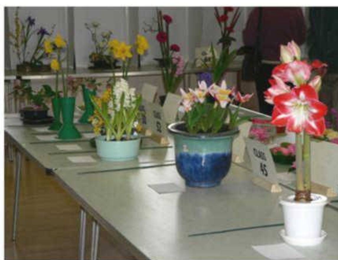
Spring No. 2