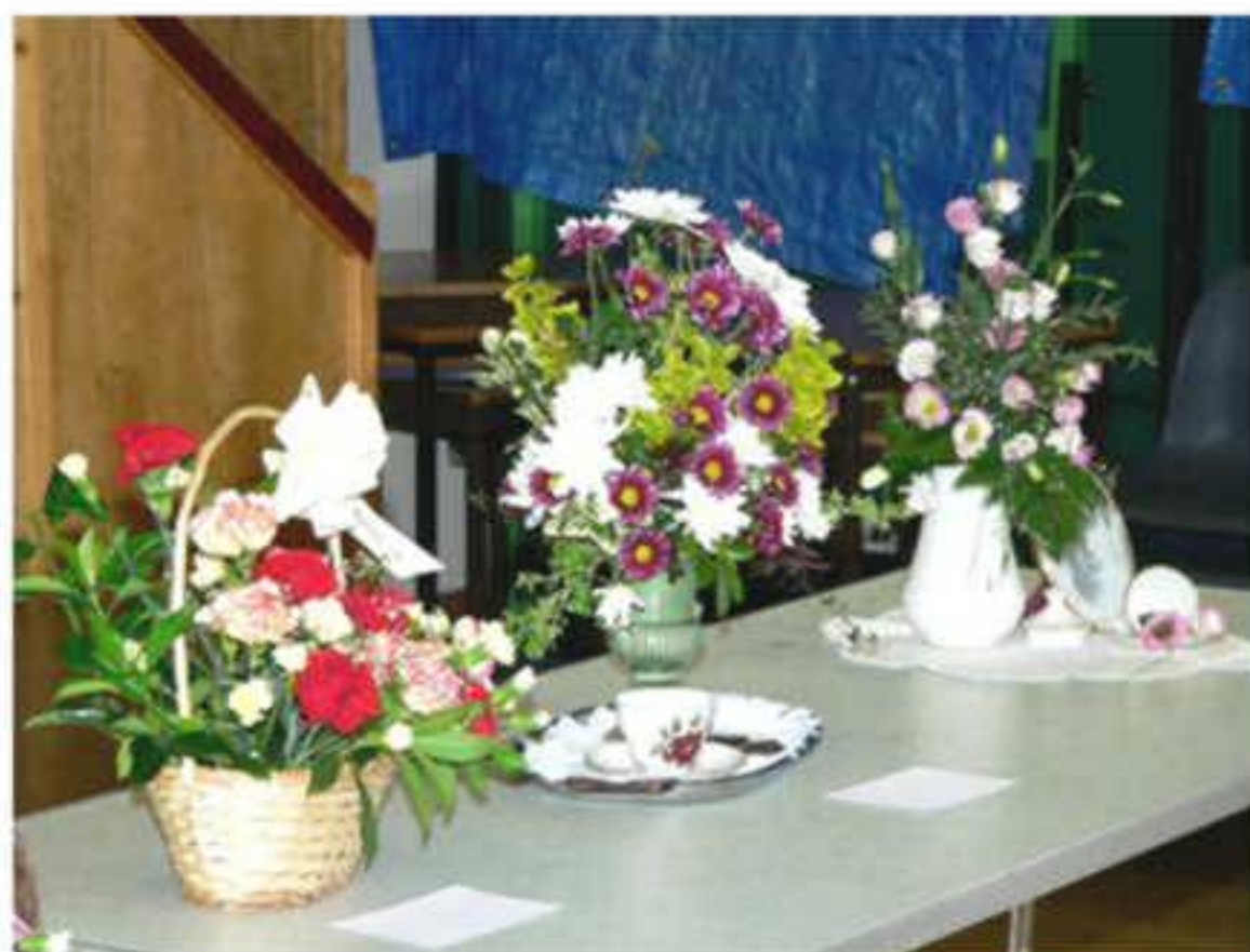
Spring No. 1