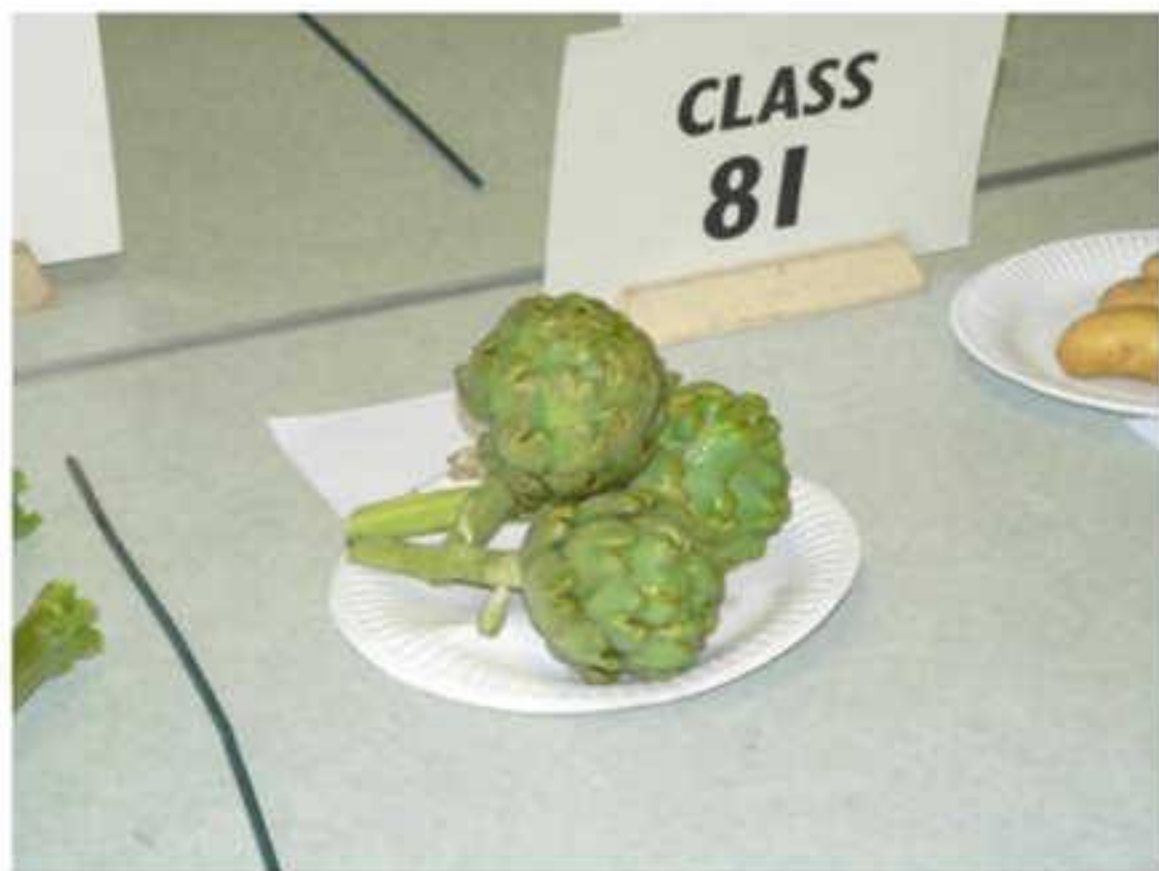
Summer No. 3