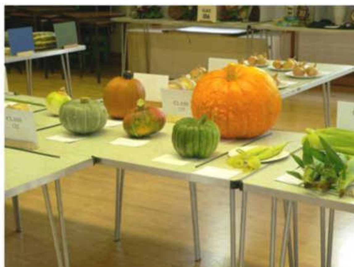
Autumn No. 2