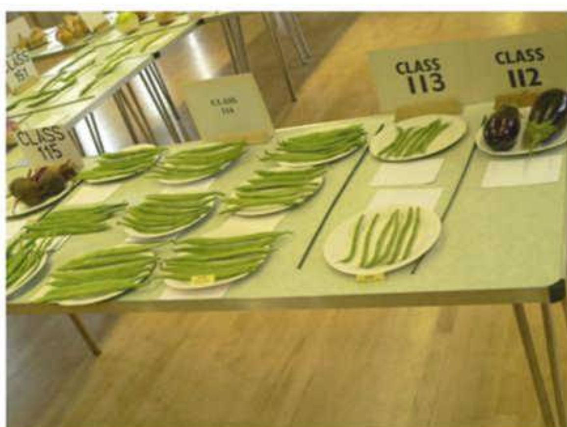
Autumn No. 3