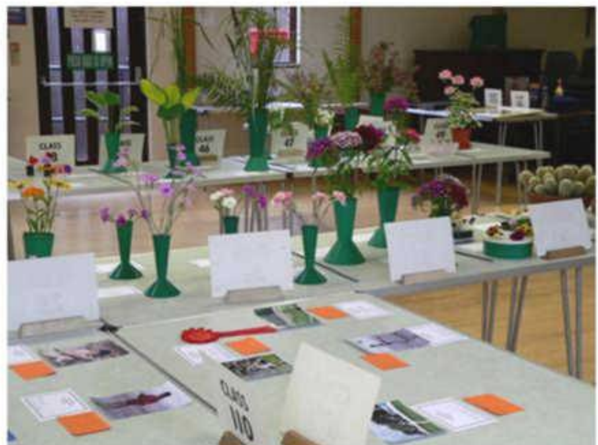
Summer No. 4