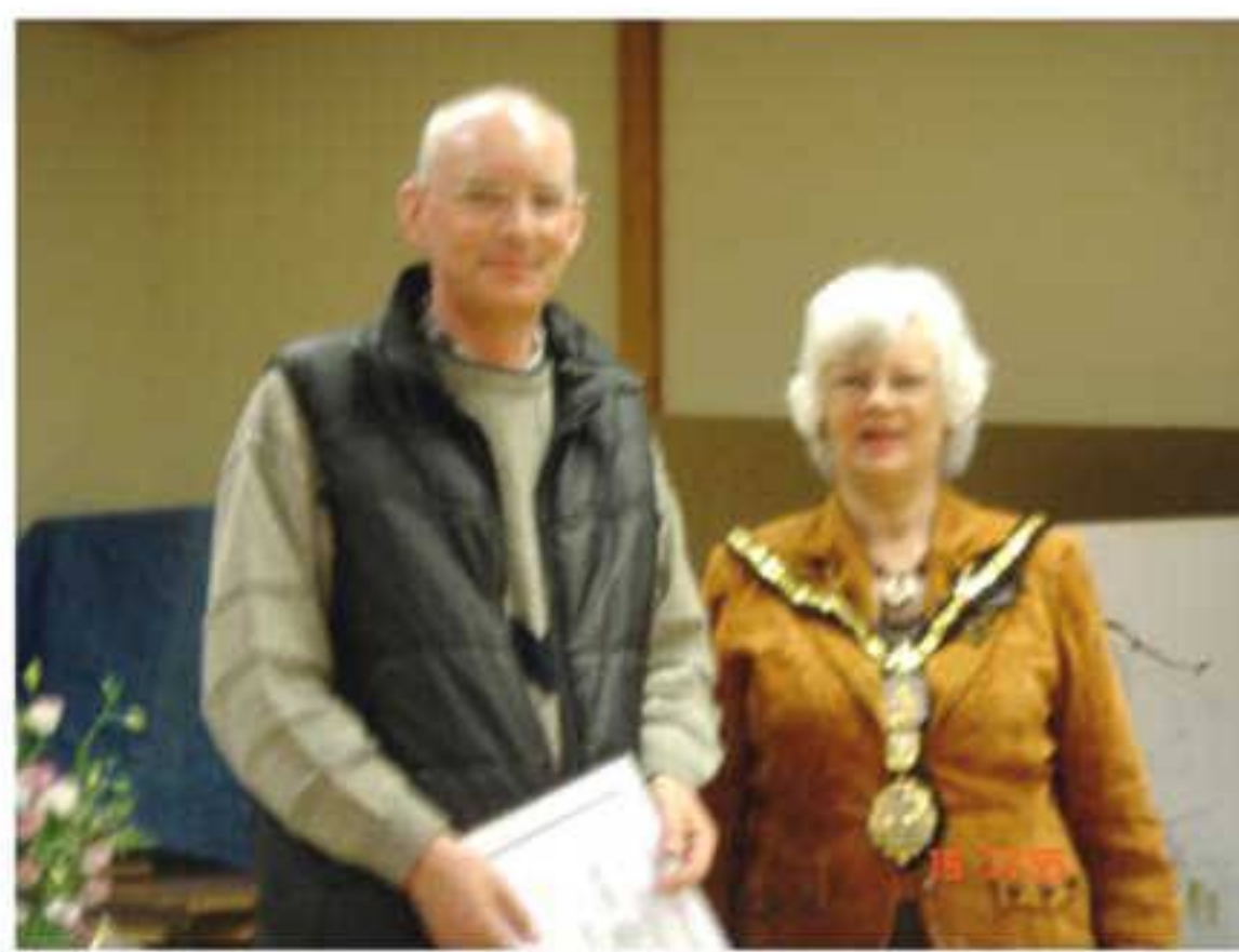
Spring No. 4