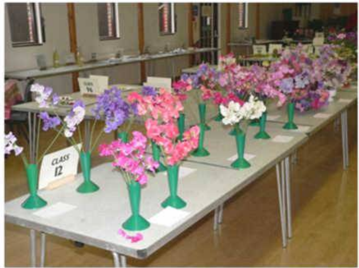
Summer No. 2