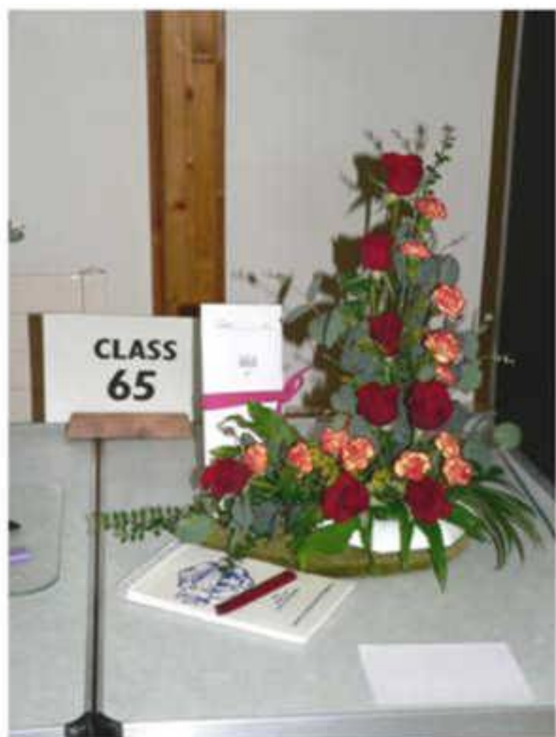
Summer No. 5