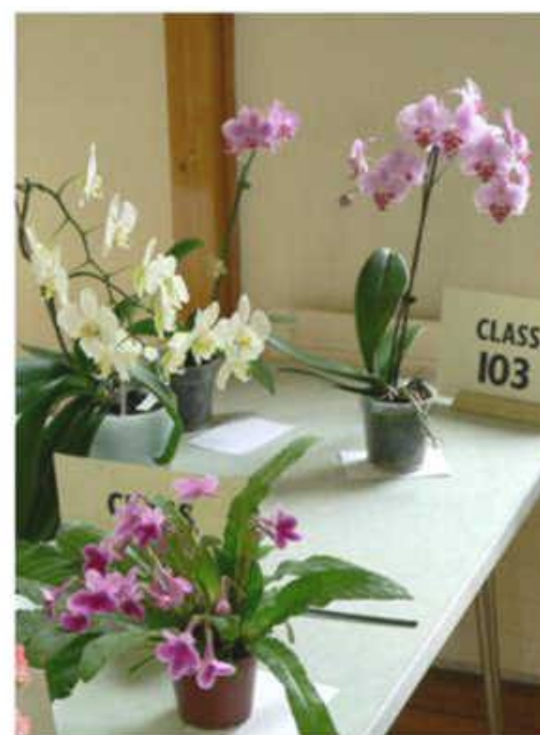
Autumn No. 6