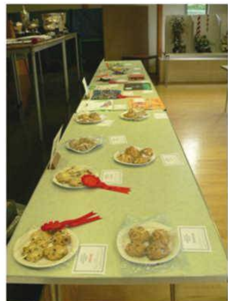
Summer No. 6