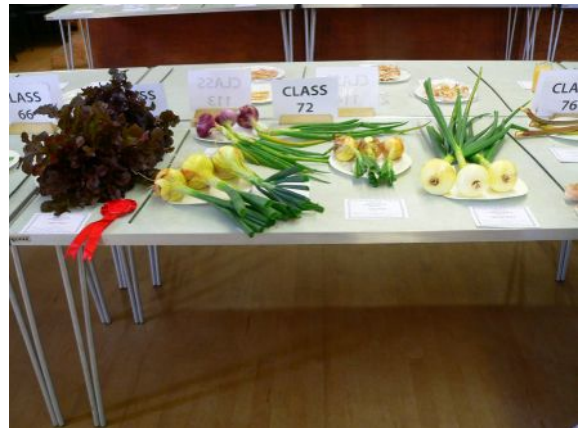
Summer No. 2