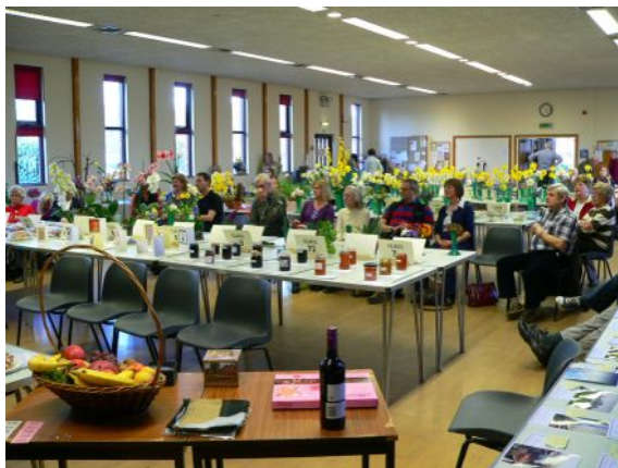
Spring No. 4