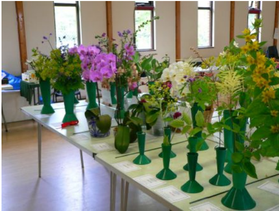
Summer No. 1