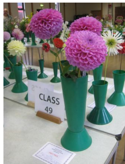
Autumn No. 5