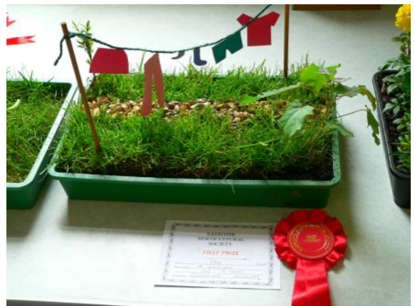
Summer No. 4