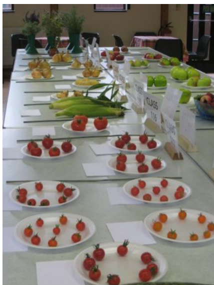
Autumn No. 4