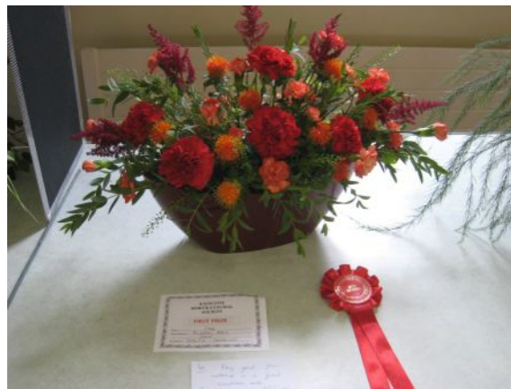
Autumn No. 3