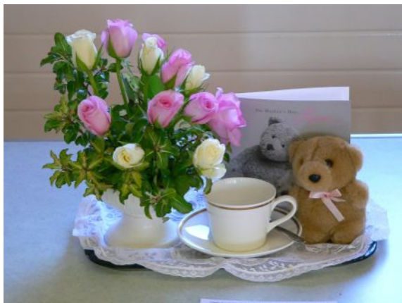
Spring No. 3