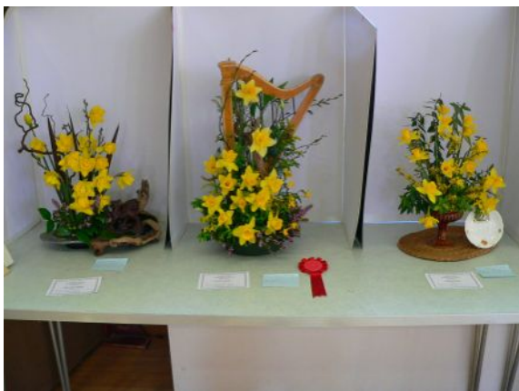
Spring No. 1