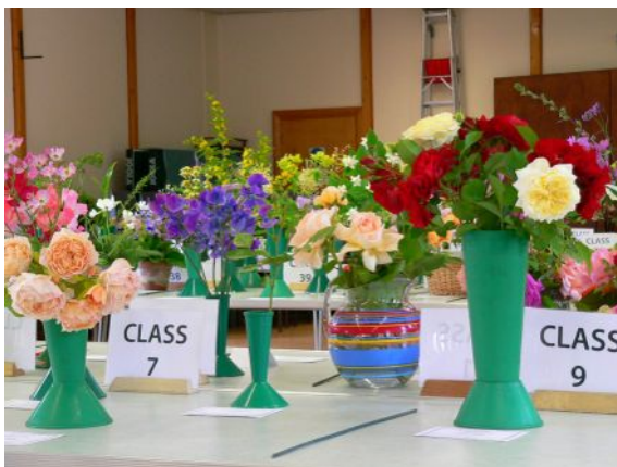
Summer No. 3