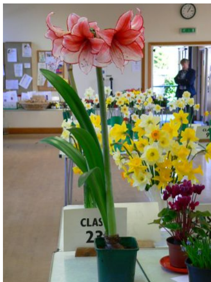
Spring No. 5