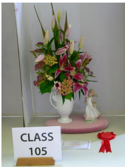
Summer No. 5