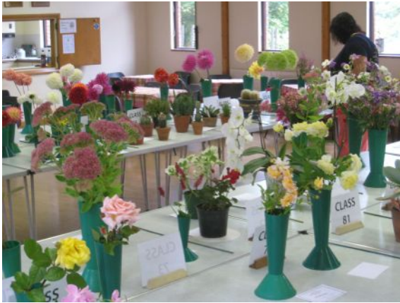
Autumn No. 1