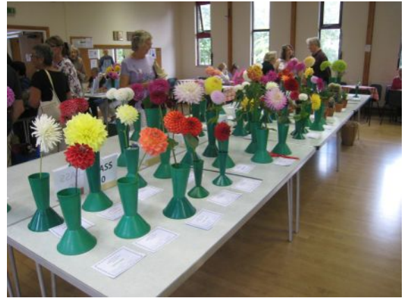
Autumn No. 2