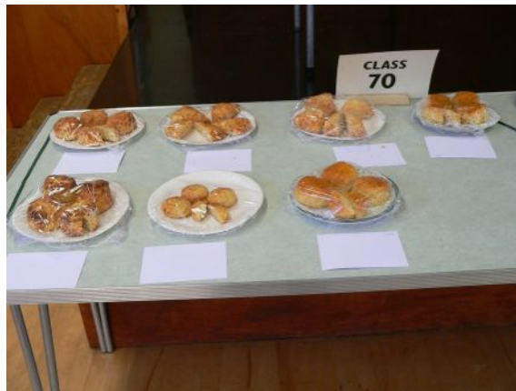
Spring No. 2