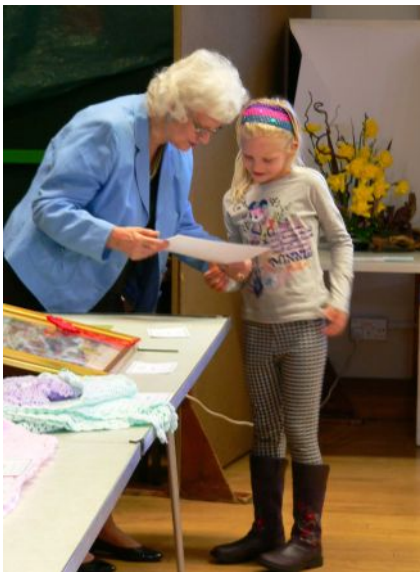
Spring No. 6