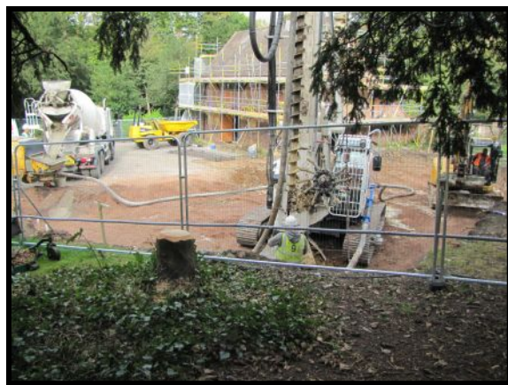
Caption right: The Piling machine used for the construction of the new building, the stables covered in scaffolding in the rear.