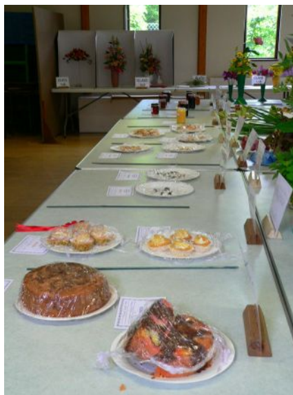
Summer No. 6