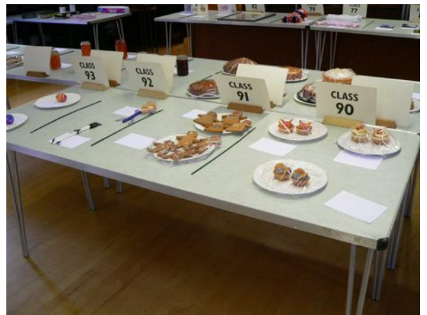
Spring No. 4