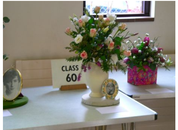
Spring No. 2