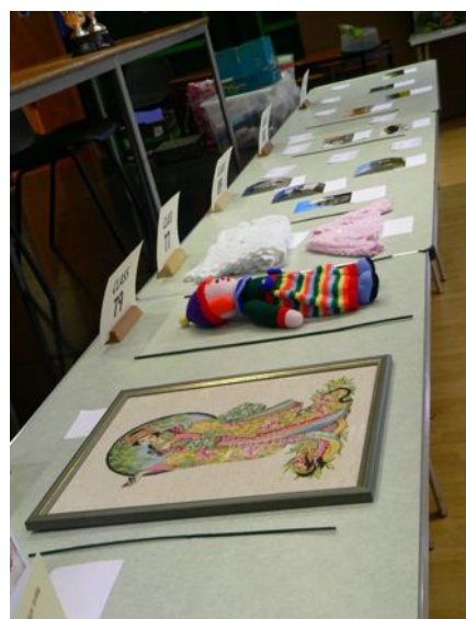
Spring No. 6