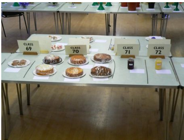
Spring No. 3