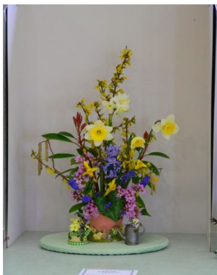
Spring No. 5