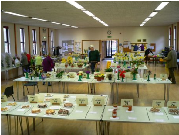
Spring No. 1