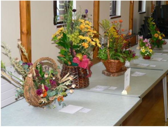
Autumn No. 1