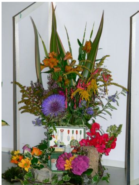
Autumn No. 5