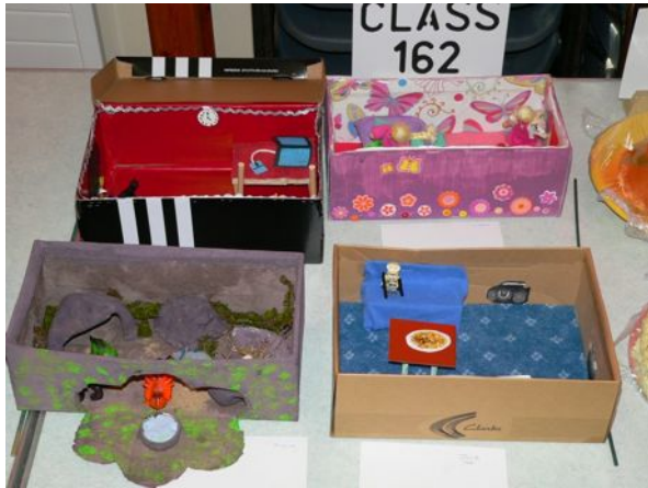
Autumn No. 3