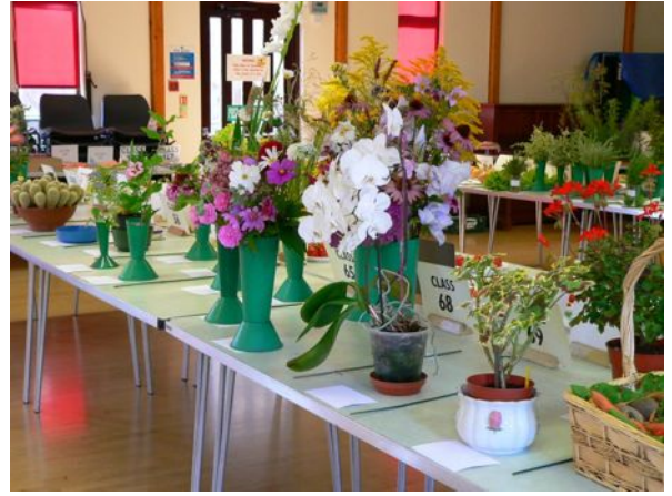
Autumn No. 2