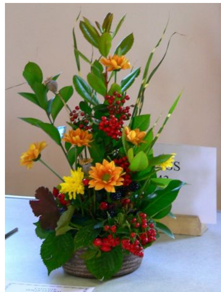
Autumn No. 6