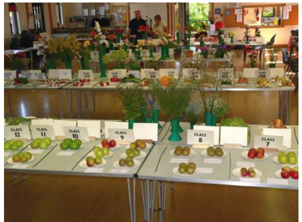
Autumn No. 4